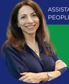
ASSISTANT GENERAL MANAGER, PEOPLE & CULTURE