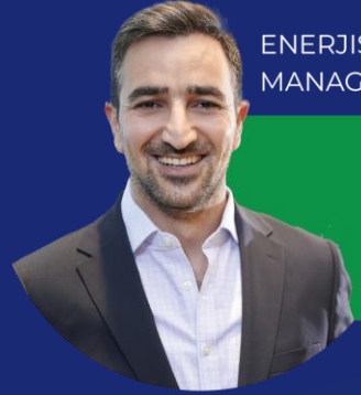
ENERJISA COMMODITIES MANAGING DIRECTOR